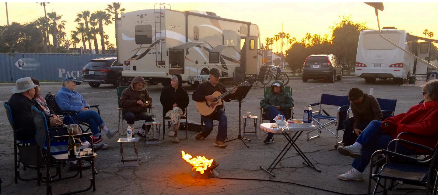
PCYC's Camping Group's Trip Over Memorial Day Weekend