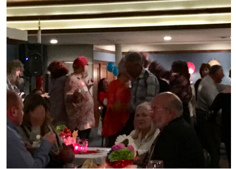
PCYC celebrates Cinco de Mayo