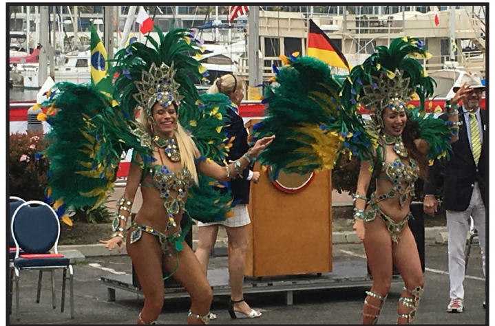
Opening Day Brazilian dancers at Santa Monica Windjammers Yacht Club.