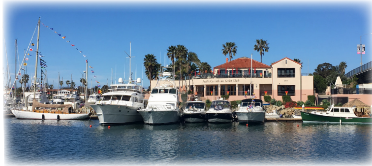
Your beautiful Club on Opening Day