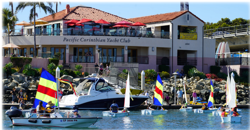
Junior Fleet Opening Day!

Nothing thrills us more than witnessing our youth develop a love for the sea and this year we want give special notice to our very first Honorary Junior Fleet Bridge Officers: