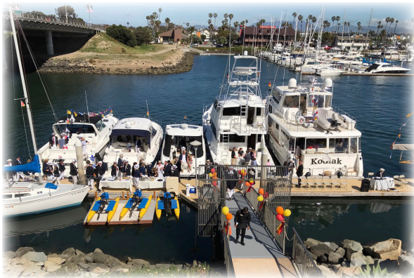
Bristol Boats 2019