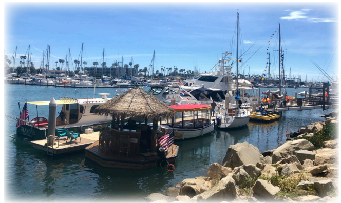
Bristol Boats 2019