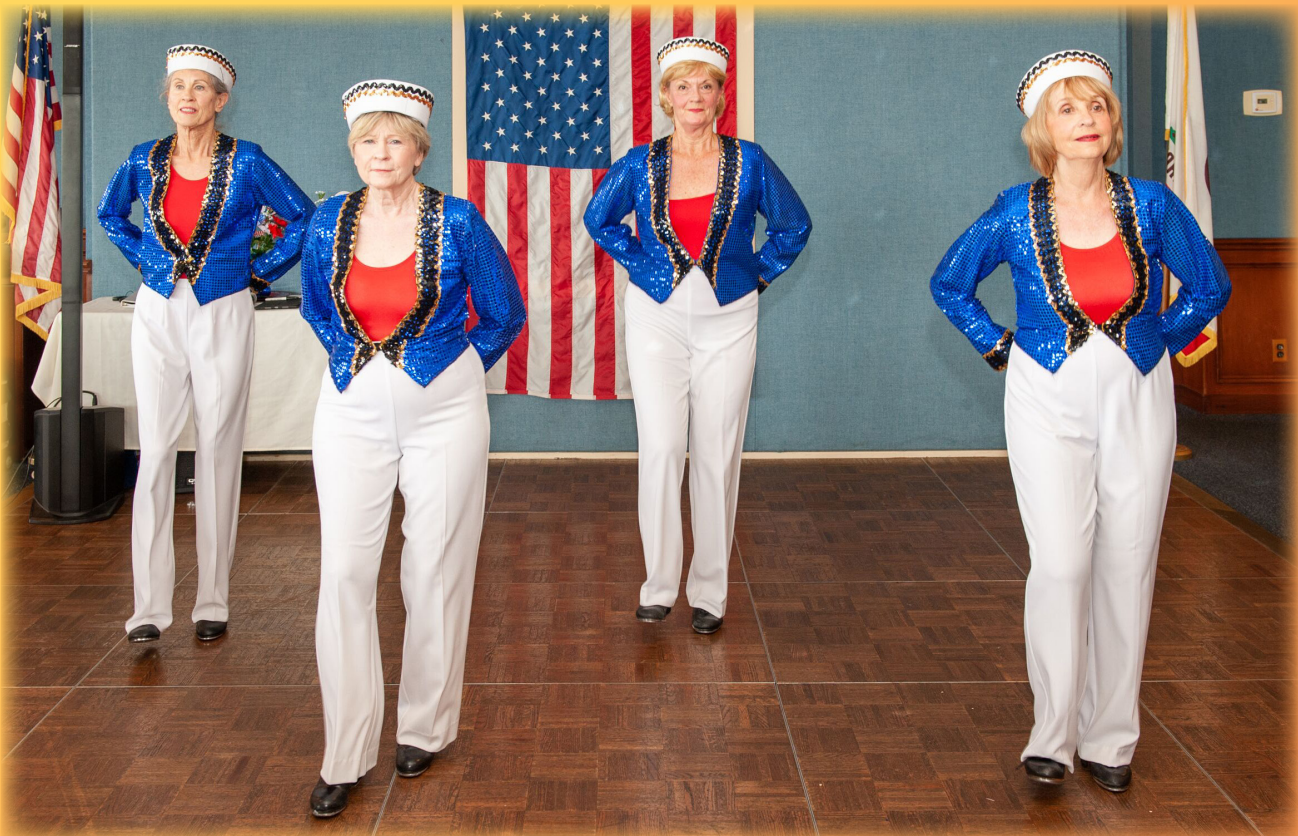
Four ladies of the tap-dancing ensemble "Razzmatappers" tapping their patriotic toes to music for the ladies gathered at this early Flag Day celebration luncheon.