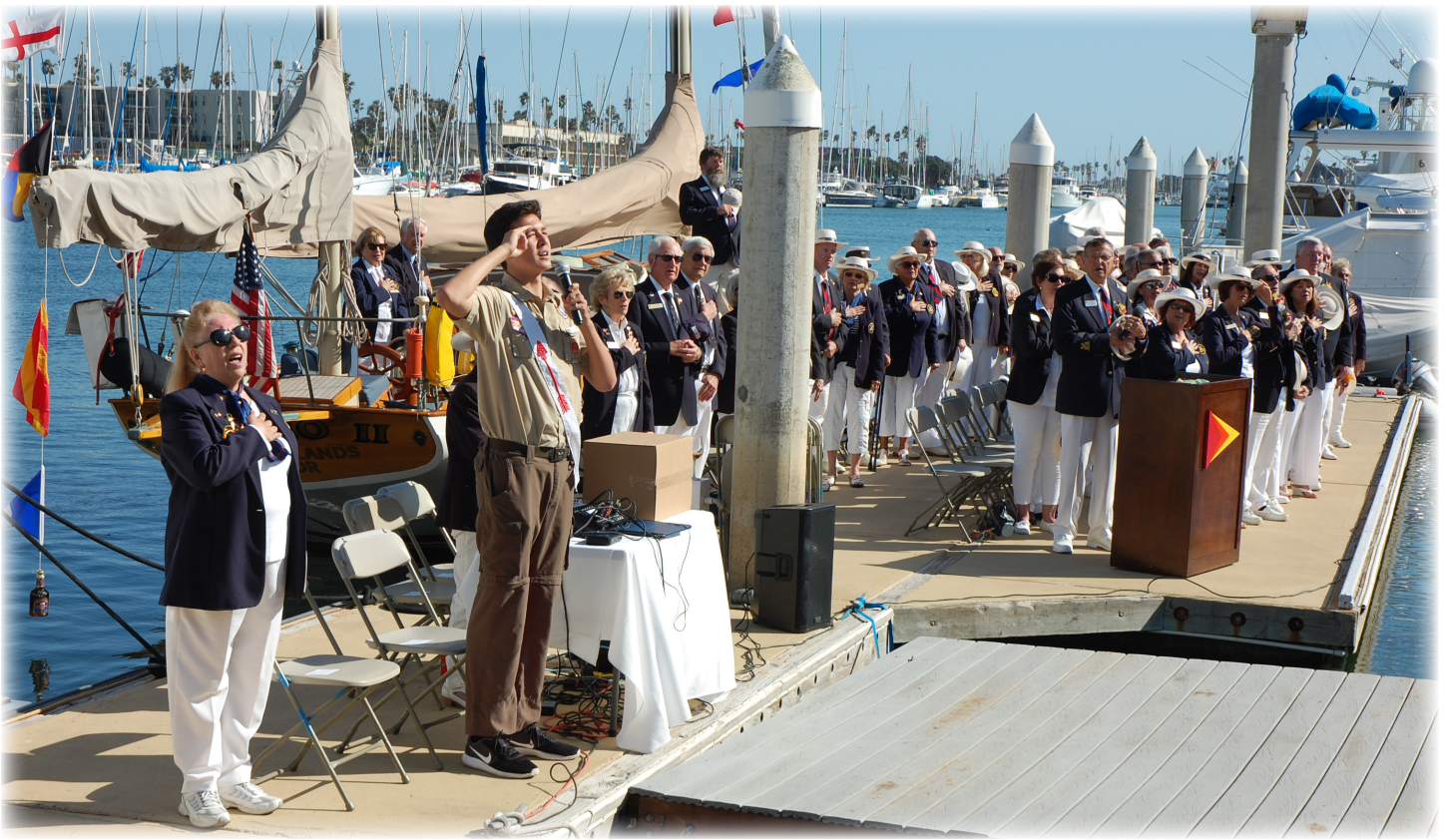
Last year's Opening Day, 2018, during the Pledge of Allegiance

You have the honor and opportunity to participate in this long held tradition. So, please mark this day on your calendar: April 6, 2019, and plan to attend this year's festivities. Watch for future announcements of times and activities for our opening day.