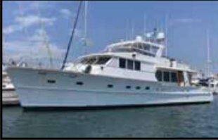
2006 Grand Banks 72' Aleutian CATC18's

Ventura & Channel Islands Harbor locations Oxnard, CA.