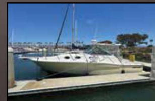
Wellcraft 3300 Clean, Twin Volvo shaft drive diesels