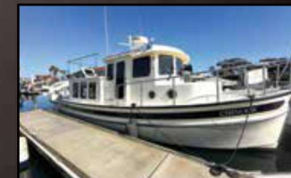
Nordic Tug 32 Cummins Powered, Bow thruster, A/B tender