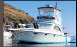
Trojan 12 meter Major 2024 upgrades