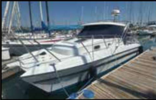
Glacier Bay 26 Yamaha Powers