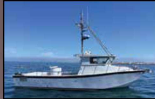
Nuwave 36 Custom Cummins Power, Furuno Sonar