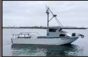
Anderson 26 Cummins & Shaft Drive