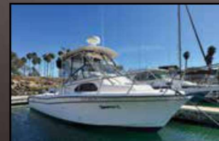
Grady White 282 Sailfish With low hours on twin Yamaha 225s