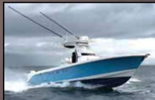
262 Edgewater CC Fully Loaded Dual Axle Trailer Included Low Hours