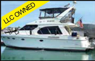
Ocean Alexander 42' Sport Sedan - LLC Owned, Cummins powered