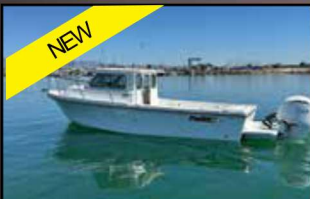
Parker 2420 Sport Cabin Twin Yamaha 150's, Seakeeper Rides