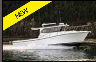
Ocean Sport 33 2026 Cummins and Shaft Drive