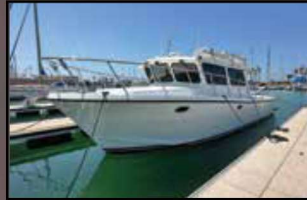
Lindell 42 Beautiful & Loaded Low Hours