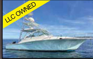
Cabo 40 Express SEAKEEPER CATC12s, Furuno TZElectronics