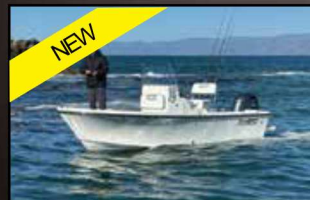
NEW 18SE Parker CC