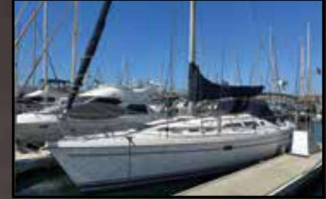
Catalina 380 Great Price.