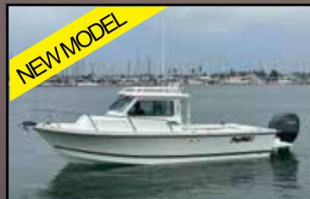
Parker 227 2026 300 Yamaha Sea Keeper Rides