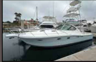
Tiara 3600 Open Cummins, upgraded electronics, full tower