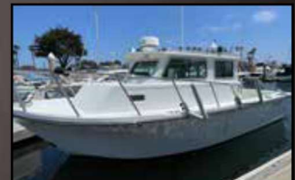
Parker 2530 Extended Cabin LLC owned, low hours.