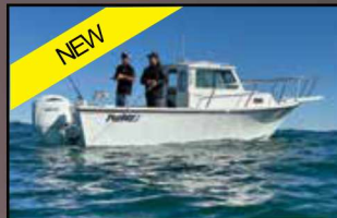
NEW 2120 Parker Sport Cabin