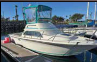
Precision 28 - Twin Volvo Penta diesels, Mathers Elec- tronic Controls, Tilt-able stain- less arch, Flybridge enclosure.

PROMOTIONAL PRICING AVAIL. ON ALL IN STOCK PARKERS