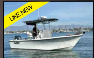
Parker 21SE CC Yamaha 200HP (100 hours), Simrad electronics, bow mounted trolling motor