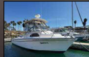
Grady White 282 Sailfish Very well cared for and rigged Grady 282 marlin w/low hours on twin Yamaha 225s