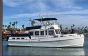
Grand Banks 49 MY Twin Luger L-6125A's, Wesmar stabilizers, Bow thruster, Watermaker, Upgraded Garmin electronics.