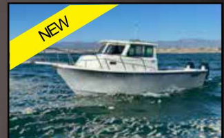
NEW 2520 Parker Twin Yamaha 200's

PROMOTIONAL PRICING AVAIL. ON ALL IN STOCK PARKERS