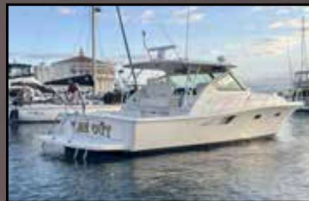
2013 Tiara 39 Beautiful Condition And Loaded