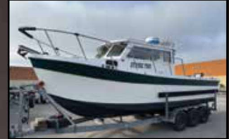
26 Osprey Diesel Powered