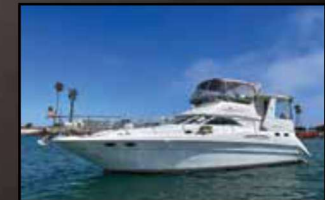
Sea Ray 420 - Beautiful aft cabin coastal cruiser with Twin CAT3116's - Recent full CATservice