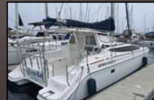
Gemini Legacy CAT35