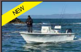
NEW 18SE Parker CC