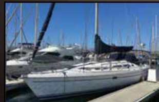
Catalina 380 Good condition w/ Westerbeke 42 Hp diesel