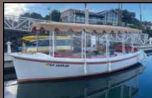
Duffy 22 Bay Island Clean & very well maintained harbor cruiser! Isinglass, enclo- sure & interior in excellent shape + room for up to 12 passengers on the larger 22ft model.