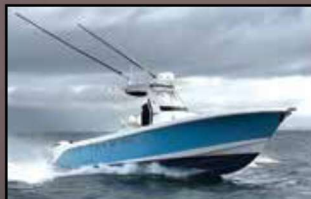
262 Edgewater CC Fully loaded - Engines Under Warranty