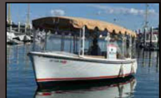
2023 Duffy 18 Excellent Condition