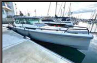
2017 Axopar 37 Clean And Well Rugged