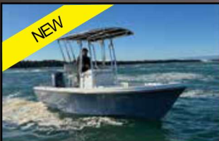
NEW 1801 Parker CC