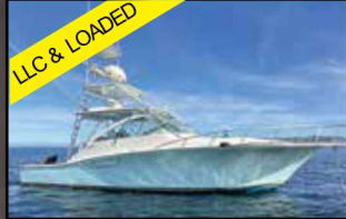
Cabo 40 Express SEAKEEPER CATC-12s, Northern Lights Genset, Furuno TZElectronics and professionally maintained. MUCH more.