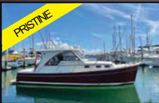
31 Marlow Beautiful and turn key w/ Yanmar and Bowthruster