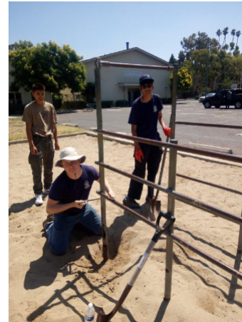
BSA Eagle Scout project

showing participation in a 9/11 honor guard, helping with a BSA Eagle Scout project, and a “fishing break” while on an