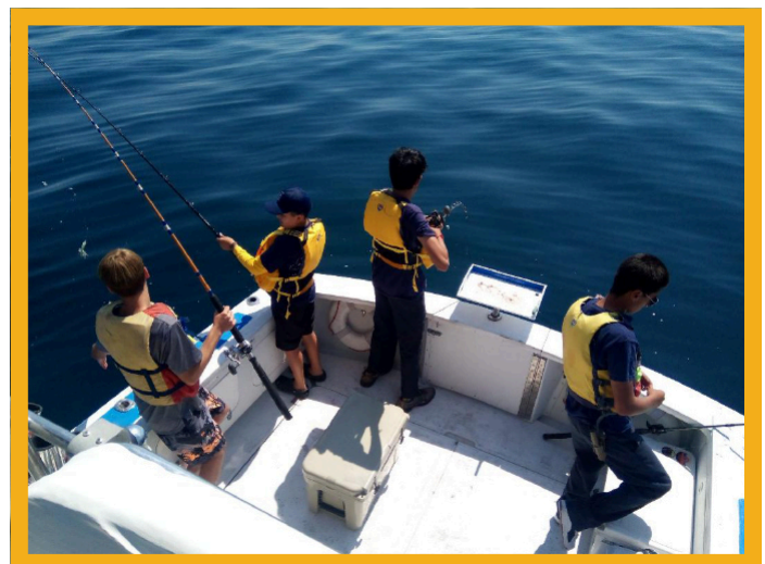
A “Fishing Break”