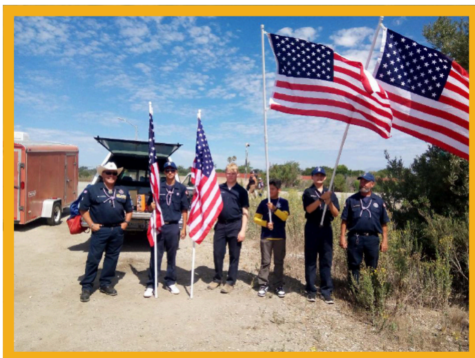
Participation in a 9/11 Honor Guard