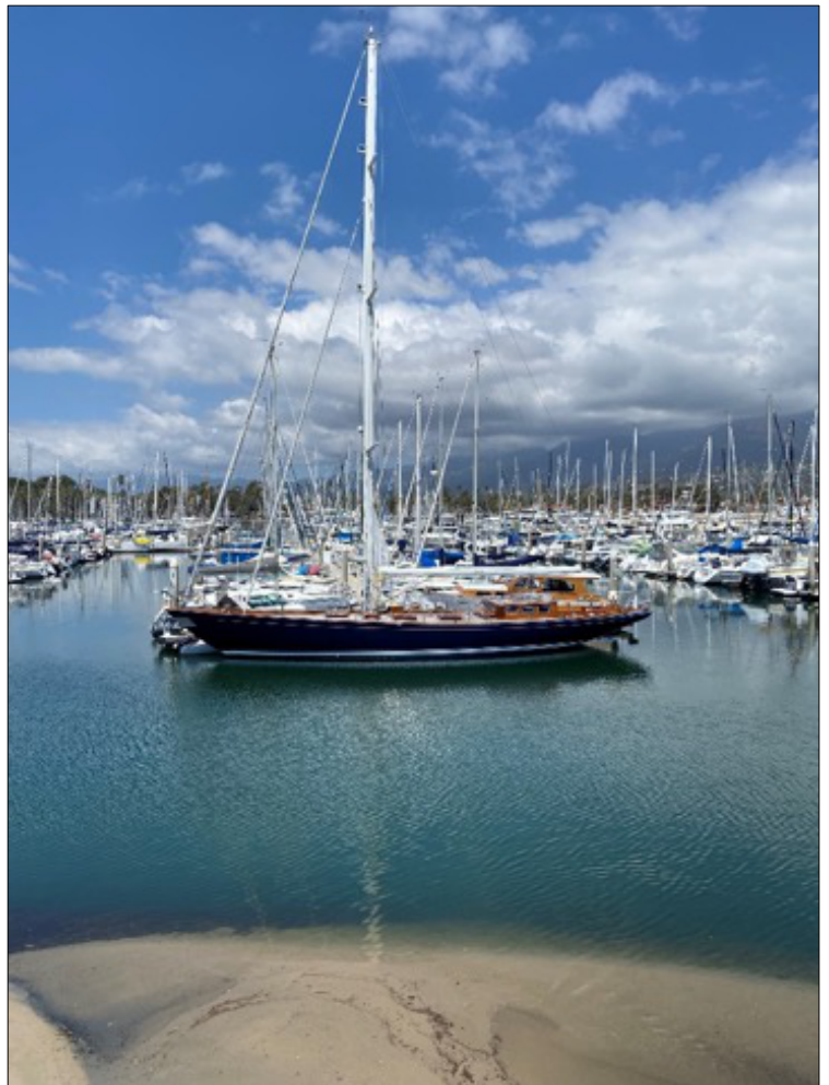
The Joy of Santa Barbara