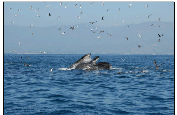
Lunge Feeding Humpbacks

2. Humpback whales ( Megaptera novaeangliae ): are known for their acrobatic behaviors such as breaching and tail-slapping. They migrate to the Santa Barbara Channel during the summer. They are easily recognizable due to their long pectoral fins, knobby head. They range in length from 48 to 62 feet and weigh in at 40 tons. They feed on krill and anchovies and use a bubble net to round up their prey. Lunge feeding is the scooping technique they use to shovel the food into their cavernous mouths.