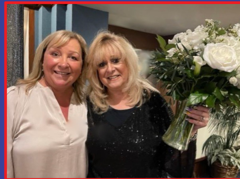
"Thank you commodore. We will miss you too."

We thank them both for their dedication and commitment to PCYC.